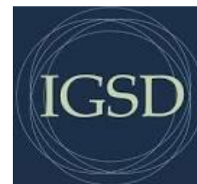
Institute for Governance Sustainable Development Washington DC

We will have peace on earth, When we have Peace with the Earth.