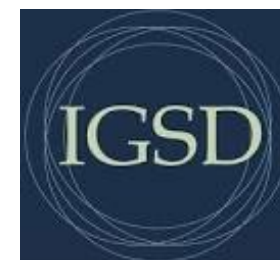
Institute for Governance Sustainable Development Washington DC

We will have peace on earth, When we have Peace with the Earth.