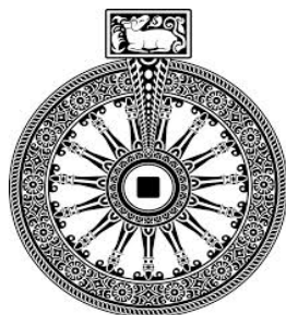
International Council for Environmental Law, Madrid