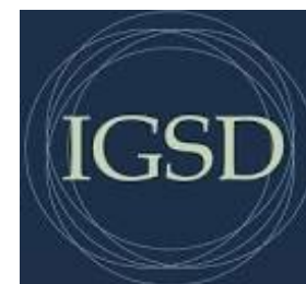
Institute for Governance Sustainable Development Washington DC

We will have peace on earth, When we have Peace with the Earth.