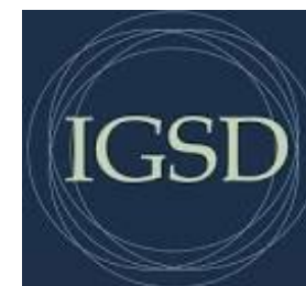
Institute for Governance Sustainable Development Washington DC

We will have peace on earth, When we have Peace with the Earth.